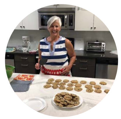
<u>Cook</u> dinner or bake goodies for our families