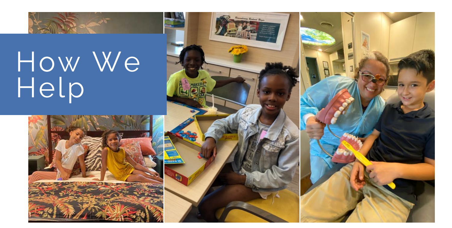
The mission of Ronald McDonald House Charities® Southwest Florida is to create, find and support programs that directly impact the health and well being of children and their families in Southwest Florida.

A family's life stops overnight when faced with a child's illness. Parents enter a world of fear and worry. There's an added stress for parents who don't live close to the medical care their child requires. Most families must travel hours for treatment. Living expenses quickly add up. Long drives, lost jobs, worried siblings, sleeping in cars, being far from family and friends are extra burdens no family should have to experience.